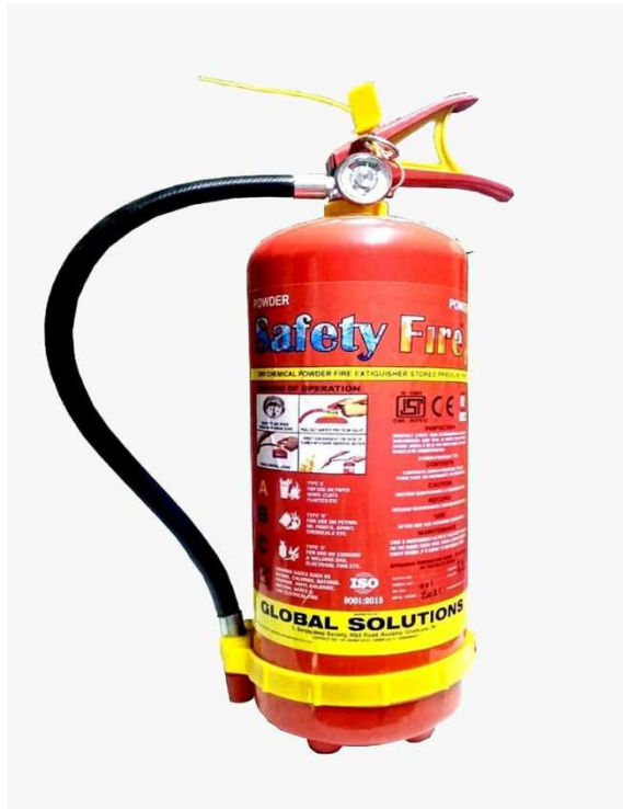
ABC type powder Fire Extinguisher 6kg