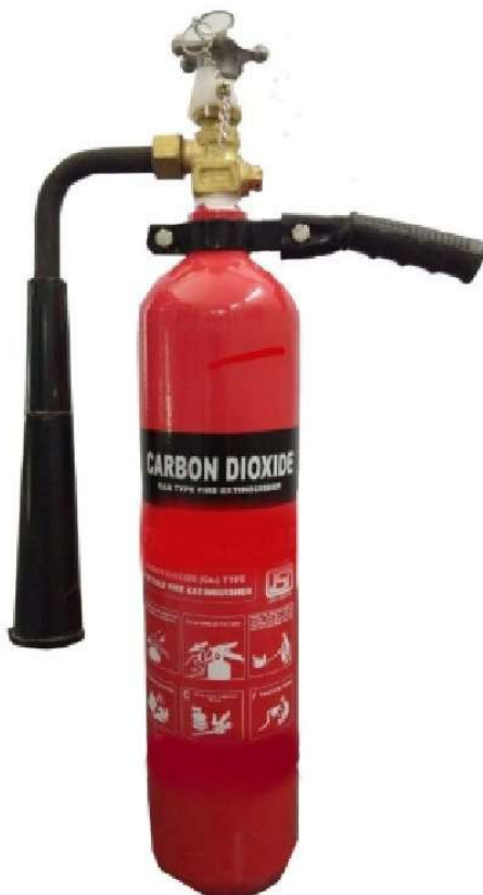
Co2 type Fire Extinguisher 4.50kg

Item No.47 Providing & Fixing 6.00 Kg ABC type Fire Extinguisher with all required equipment & Labour comp.